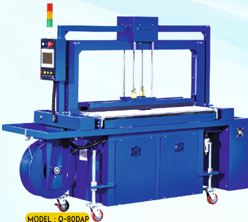
MODEL : Q-80DAP